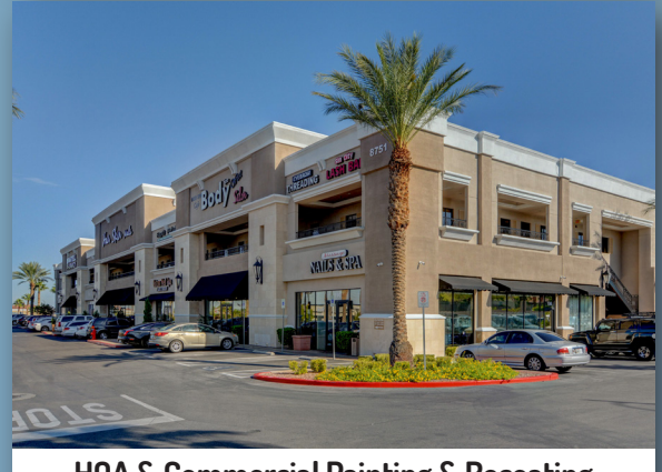
HOA & Commercial Painting & Recoating