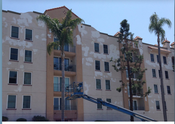
HOA & Commercial Stucco Repairs & Application