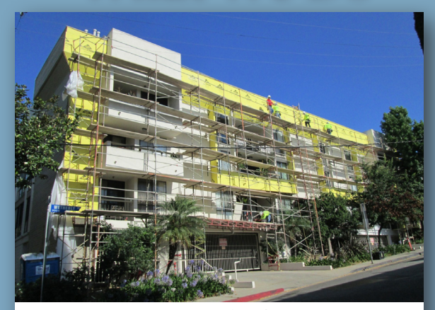
HOA & Commercial Defect Repairs