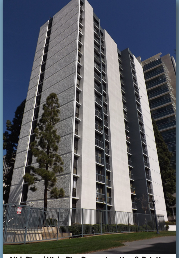
Mid-Rise / High-Rise Reconstruction & Painting